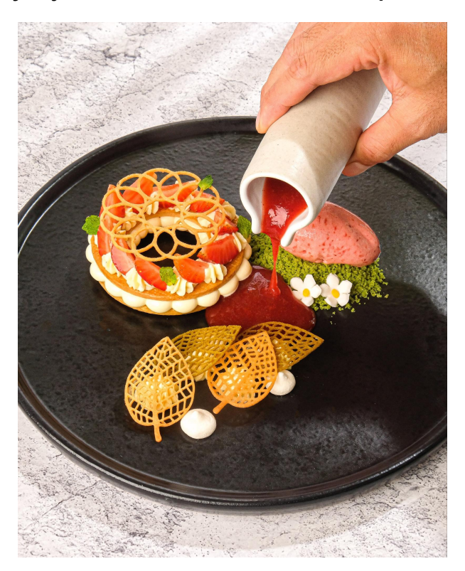
Something sweet and exciting is coming to Uluwatu this month!

Bali, March 2024 — Prasana by Arjani Resorts is thrilled to announce the opening of Petit Garçon, a unique dessert bar in the serene Uluwatu area. Situated within a tranquil neighborhood, Petit Garcon is poised to redefine Uluwatu's dining landscape, making it a destination for those with a sweet tooth.